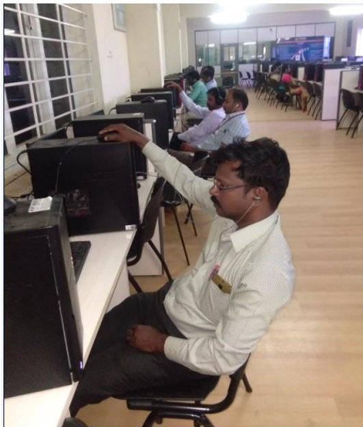
The staff members enthusiastically attending the workshop.

After attending the workshop the staff members had an idea about this SCILAB . More videos on SCILAB were given as softcopy to the staff members to prepare themselves and to attend the online Exam.