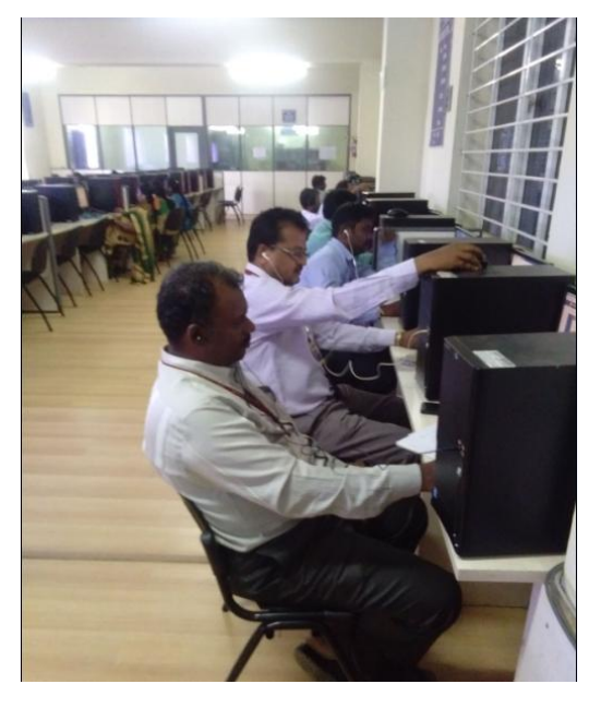
The staff members attending the online Exams.

The exam duration was about 45 minutes. After the exam, certificates were generated to the staff those who have secured above 40 % of marks to their individual User Id.